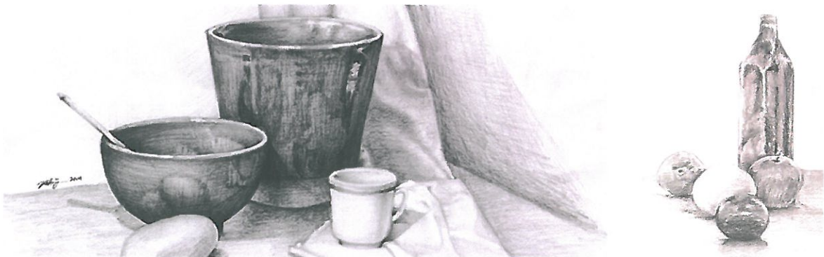
Examples of Composition