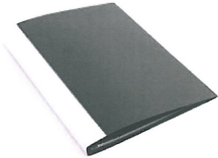
A3 Portfolio size (29.7 cm x 42.0 cm)

Be sure to organize your work into a cohesive presentation, labelling each item. This may be achieved by mounting all work on either landscape or portrait format stiff cardboard (black, white or grey) and by organizing it by category (3d models, ink drawings, pencil drawings, etc.) You should also label your work and include a very brief description if you think appropriate.